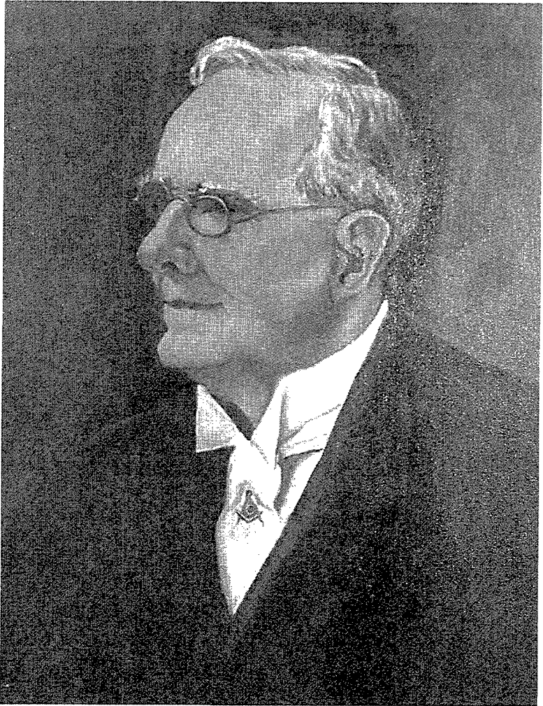
Governor Sidney Johnston Catts (1917-1921) helped to perpetuate and intensify the nativist and racist atmosphere in Florida during the 1910s and 1920s.

his successor Sidney Catts (1917-1921) initially ignored it. Trammell, who had been the state's attorney general prior to becoming governor, was no friend of black Floridians. During his attorney generalship, he had disregarded the lynching of twenty-nine blacks and did the same when another twenty-one were lynched during